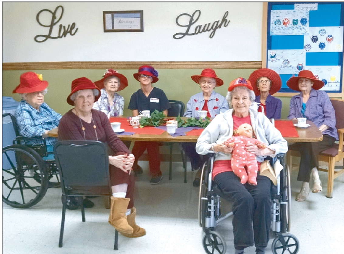
Tea Time! Residents of the Bronte Health and Rehab Center recently enjoyed tea and cookies while visiting with members of the Red Hat Society.