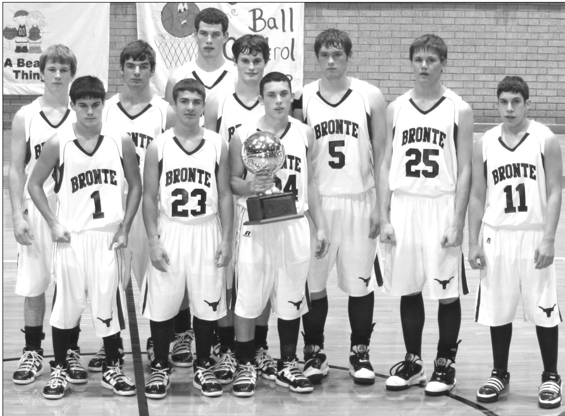
Longhorn Basketball! The Longhorns defeated Fort Davis Friday evening, February 25, in Crane to win the area championship.